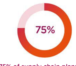
75% of supply chain planning will be supported by Al